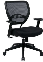
Office Star 5500 chair