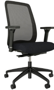
AIS Bolton chair