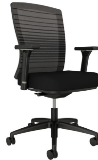
AIS Natick chair