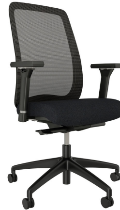
AIS Bolton chair $329 free freight