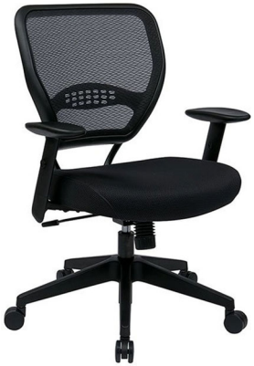
Office Star 5500 chair $293 +$48 freight