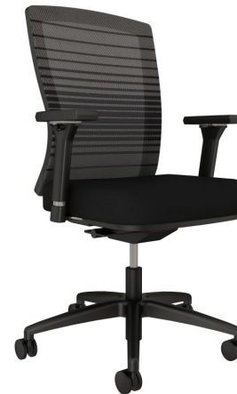
AIS Natick chair $575 free freight