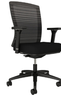
AIS Natick chair